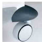
Castor with brake

Zimmer MedizinSystems Corp. 25 Mauchly, Suite 300 Irvine, CA 92618 Phone (800) 327-35 76 Fax (949) 727-21 54 info@zimmerusa.com www.zimmerusa.com